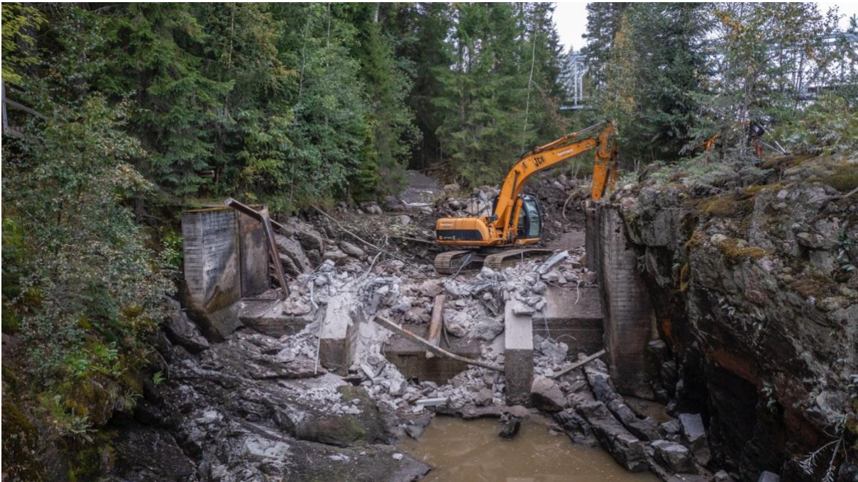
Programme-supported removal of the Ritakowski Dam