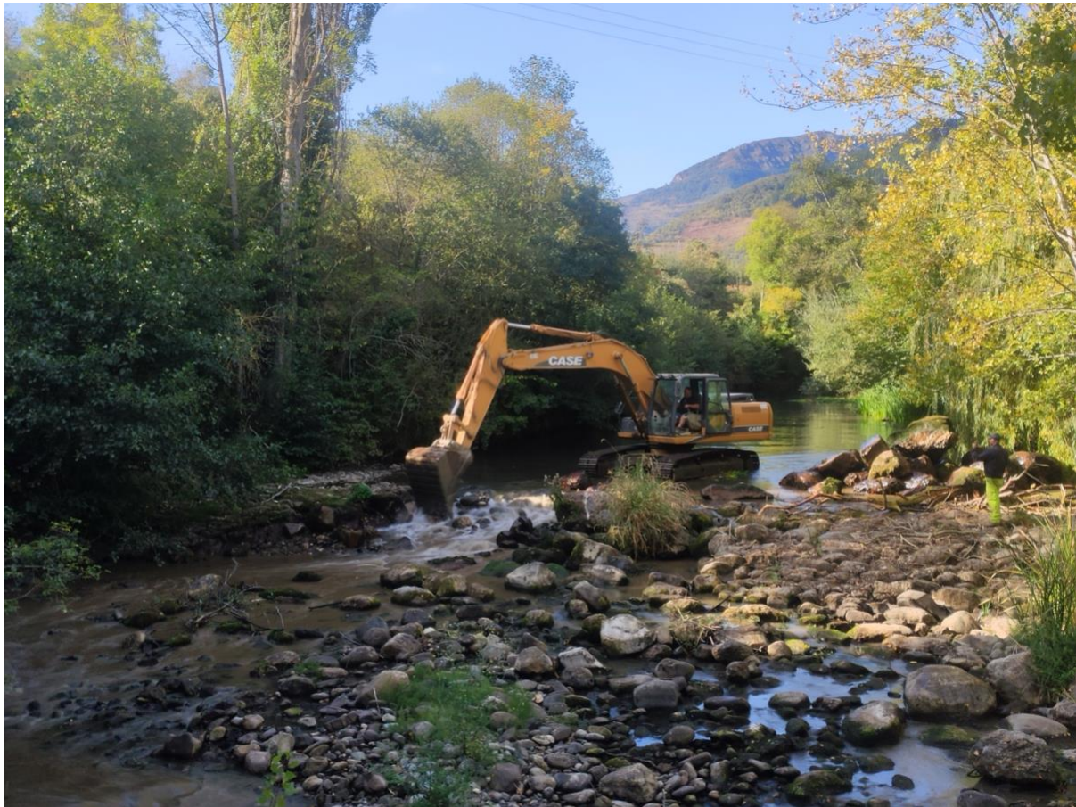
Programme-supported removal of the Tama Dam, Spain